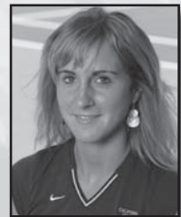
MARGARET JESSEE WARREN TENNIS SCHOLARSHIP