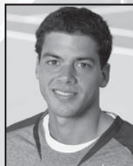
EDMUND L. LEVY SCHOLARSHIP