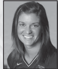
HELEN WILLS ROARK SCHOLARSHIP