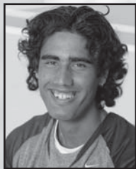
EDWARD G. CHANDLER SCHOLARSHIP