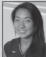
ISABELLA HILL PERKINS TENNIS SCHOLARSHIP FUND