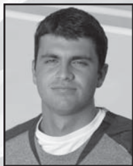
CHANG FAMILY SCHOLARSHIP