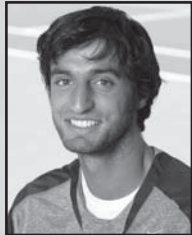
RAYMOND CASEY MEMORIAL FUND