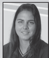
HAZEL HOTCHKISS WIGHTMAN TENNIS SCHOLARSHIP